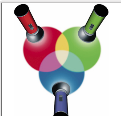
▲ 01 Monitors use additive colours, throwing light onto a dark screen. The more lights added, the brighter the result. Note that red and blue make magenta, red and green make yellow, and blue and green make cyan.

The widest colour space of all is used in Raw, which is the format captured by high-end digital cameras. It's good for tweaking photographs, but is wasteful of resources, as the files tend to be very large. The Raw