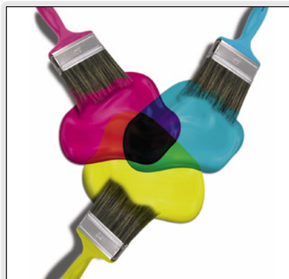
▲ 02 Printing inks start with white paper: the more ink is added, the darker it gets. Cyan and magenta make blue, yellow and magenta make red, and blue and yellow make green.